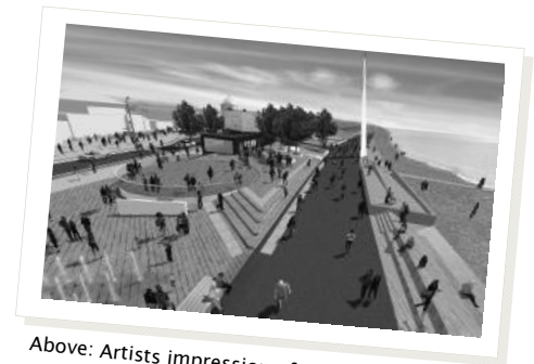
Above: Artists impression of the new City Beach

There will also be changes to the layout of the parking bays in the central reservation at Western Esplanade from straight to diagonal. A new cycling path will also be installed making it possible to cycle off road from East Beach to Chalkwell.