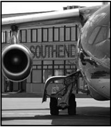
Above: Exciting times ahead for Southend Airport