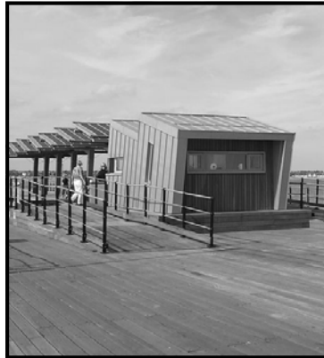
Above: The Pier Head will benefit from a fresh £3 Million cash injection

It is hoped that the pavilion will be used for conferences, weddings, cultural performances and artist studios