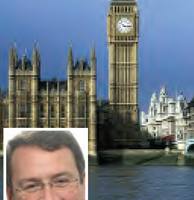
By Mark Hoban MP for Fareham

I am very grateful to the residents of Titchfield and Titchfield Common for their support in the recent General Election.