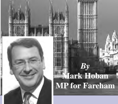
By Mark Hoban MP for Fareham

ONE OF the biggest issues in my post bag is tax credits. Figures released in May showed in the year to April 2006 that 900,000 families received less than they were due and 1.9 million received more than they were owed – one in three claims made end up with someone getting the wrong amount.