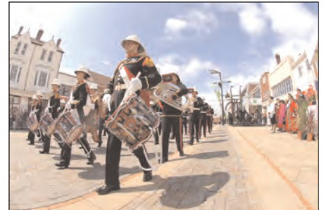
Crowds thronged the town centre to greet former Prime Minister Baroness Thatcher when she came to Fareham to take part in ceremonies to mark the 25th anniversary of Britain's victory in the Falklands War. (Full story and more pictures on the back page)