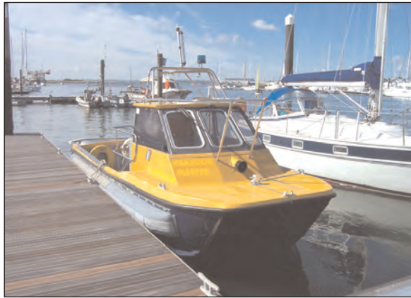
Busy: Hamble harbourmaster's launch is always ready.

speeding Ribs, investigated stolen tenders and dealt with children jumping from Bursledon Bridge and both Hamble and Warsash jetties.