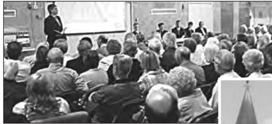
Packed: Residents turn out in force at the public meeting. Inset: the tower

WIDESPREAD concern over plans by the owners of Locks Heath Shopping Centre to demolish the landmark clock tower brought 400 residents flocking to a public meeting in the Community Centre.