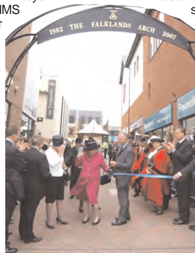
Lest we forget: Baroness Thatcher cuts the ribbon at the memorial

The Council commissioned the £25,000 arch to commemorate all who lost their lives in the war.