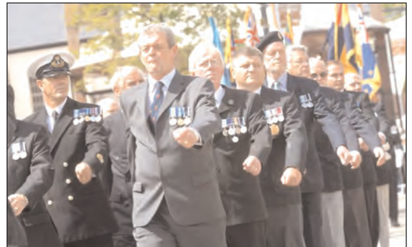
Marching in memory: Heads held high, medals glinting, Falklands veterans salute their leader in war.