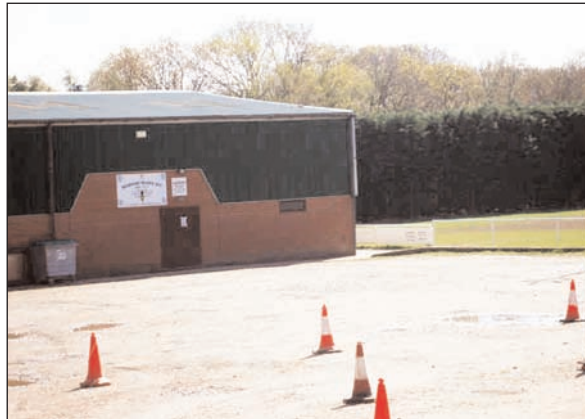
All weather: The site of Warsash Wasps' new pitch.

"This would increase the number of games played, as 20-30% of ses-