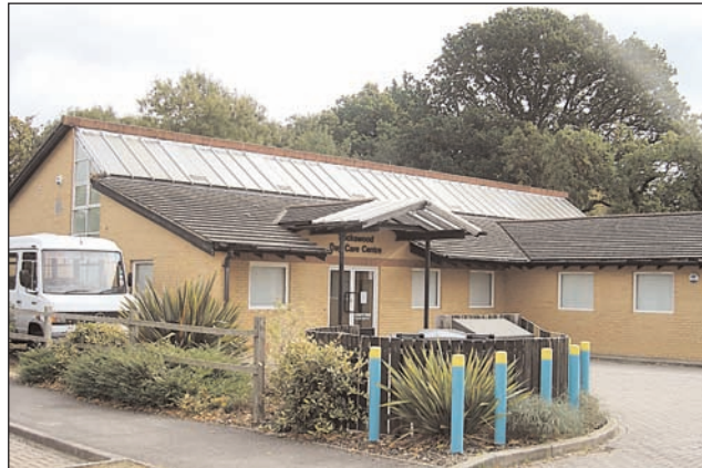
Concern: Elderly users of the Lockswood Centre are worried by Age Concern's takeover.