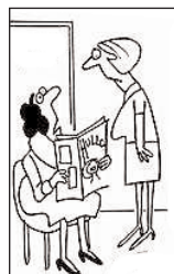
"I'm not here to see the doctor, just to read the magazines."

A new patients' participation group has been set up there and is seeking members.