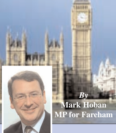
By Mark Hoban MP for Fareham

You have to make difficult decisions in your life, which require a sacrifice today to achieve a better tomorrow. Do you go to college to get more qualifications or straight into work; or sacrifice nights out to repay debt or save for a deposit?