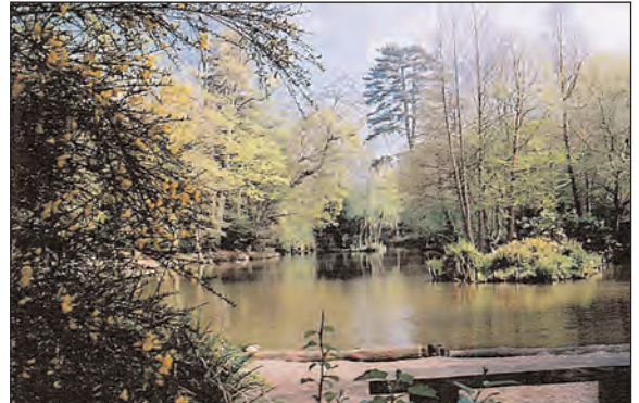
Beauty: With areas like Holly Hill Woodland Park in which to roam, it's no wonder the people are happy.