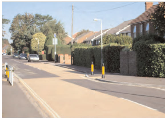
Clear run: Yellow lines are the answer in Church Road.

PARKING has been causing headaches in Warsash, but the County Council responded after local Conservative councillors demanded action.