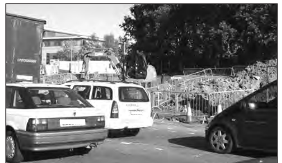
Under way: Work progresses at Segensworth.

However, the County Council is working closely with the contractor to try to keep this to a minimum.