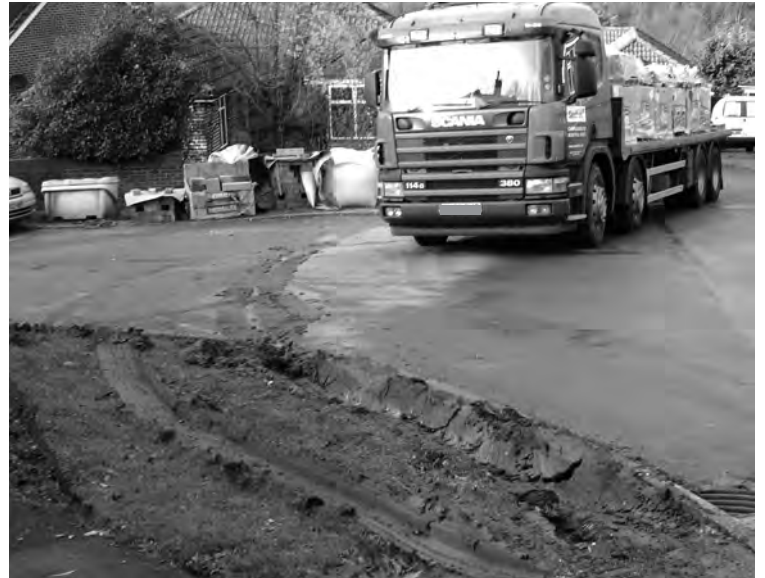
Rutting season: A resident snapped the lorry which churned this verge in Riverside Avenue, Wallington into a quagmire. Note the building materials dumped on the verge opposite.

imposed after complaints by residents of indiscriminate or dangerous parking.