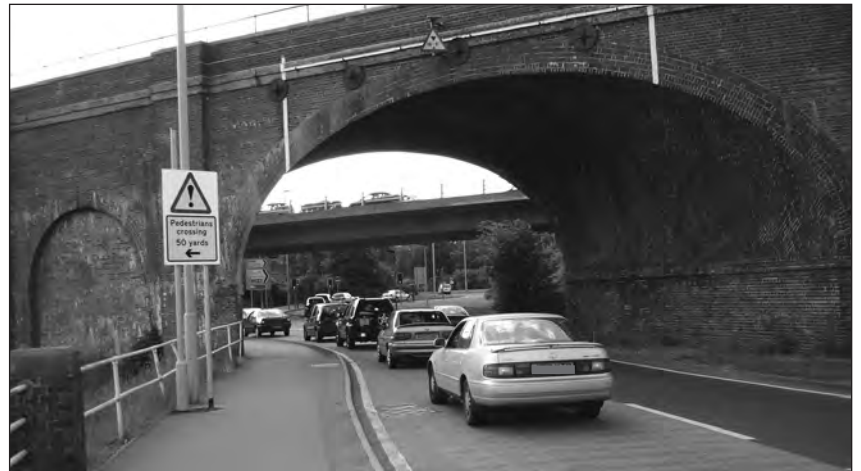
Congested: Traffic queues under the viaduct where some of the proposed safety measures are already in force.

Councillor Ernest Crouch said a camera was installed overlooking the recently marked out pedestrian crossing and ran all day so that traffic and pedestrian movements could be studied for peak and off-peak times.