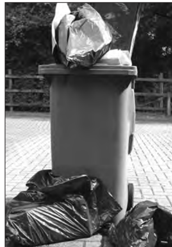
Not the way to do it: ‘Dusties’ will only collect garden waste that’s in official green bags.

However it is not possible to collect green waste in anything but the bag provided.