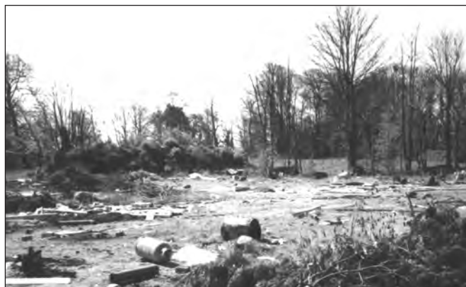
Devastation: This is how travellers left the Lysses site.

He added: "Any proposal that allows different beneficial rules to apply to minority groups at the expense of the majority is unacceptable."