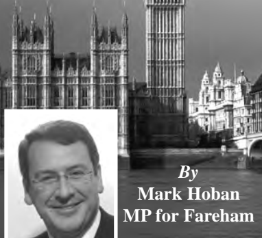
By Mark Hoban MP for Fareham

U nder Mr Blair's Government, council tax bills have gone through the roof. Pensioners, on fixed incomes, have been hit the hardest by this stealth tax, with the hike in council tax snatching back over a third of the increase in the basic state pension for a typical pensioner. To make matters worse, if it keeps going up at the current rate, experts predict bills will hit £2,000 for the typical household if Mr Blair wins a third term in power.