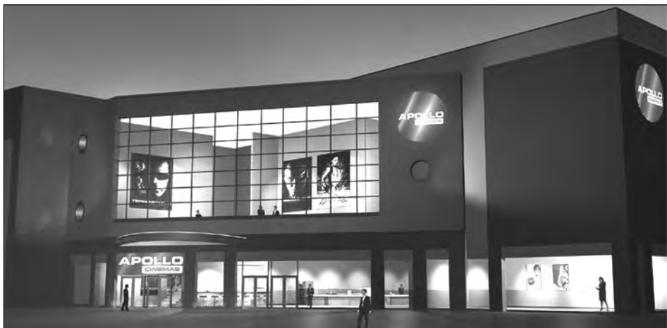
Apollo launch: Artist's impression of the state-of-the-art cinema at Market Quay.