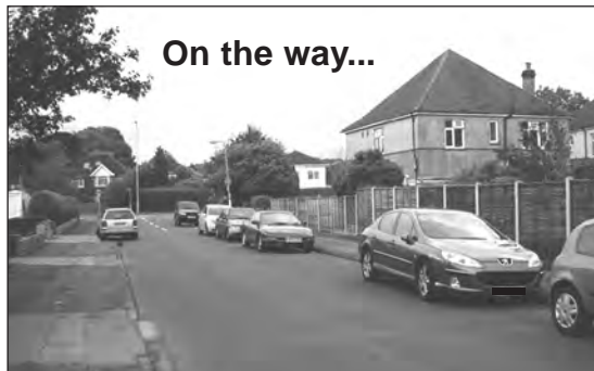
Beaulieu Avenue: Restrictions will ease problem.