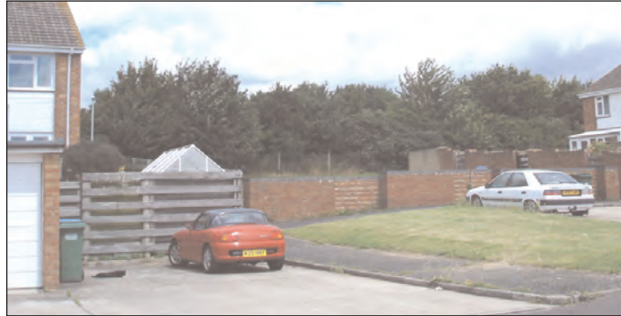
Robinson Court: The Council wants to build affordable flats here.

A DEPUTATION of residents objecting to a Council plan to build a block of four flats at Robinson Court, Portchester has led to a rethink.