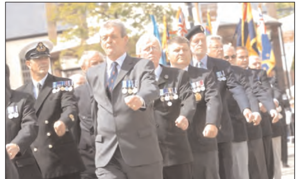
Marching in memory: Heads held high, medals glinting, Falklands veterans salute their leader in war.