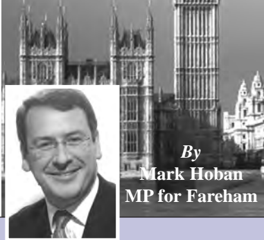
By Mark Hoban MP for Fareham

ONE OF the biggest issues in my post bag is tax credits. Figures released in May showed in the year to April 2006 that 900,000 families received less than they were due and 1.9 million received more than they were owed – one in three claims made end up with someone getting the wrong amount.