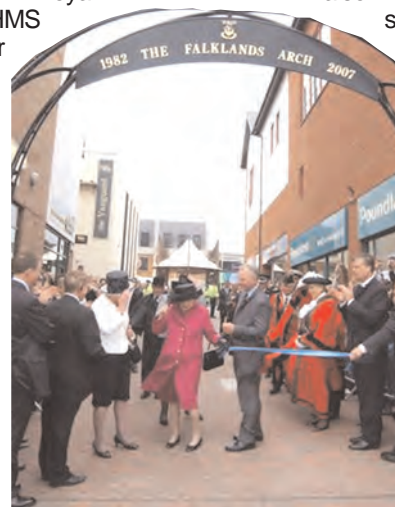
Lest we forget: Baroness Thatcher cuts the ribbon at the memorial

The Council commissioned the £25,000 arch to commemorate all who lost their lives in the war.