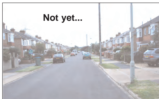
Birdwood Grove: Still awaiting 'no waiting' move.