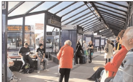
On the buses: Fareham bus interchange has shown a rise in travellers.

Thirty bus operators provide 310 bus services in Hampshire, of which 200 are subsidised by the County Council at a cost of £6.4m a year because they are not commercially viable.