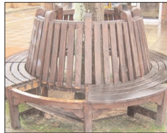
On hold: The seat (above) is due to be replaced and the precinct's lampposts repainted.

A MAKEOVER for Portchester precinct, which had been put on hold because it went over budget, can now go ahead.