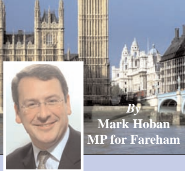
By Mark Hoban MP for Fareham

As part of the Conservative Treasury team, I spent much time over the summer thinking about how the Government got us in a mess.