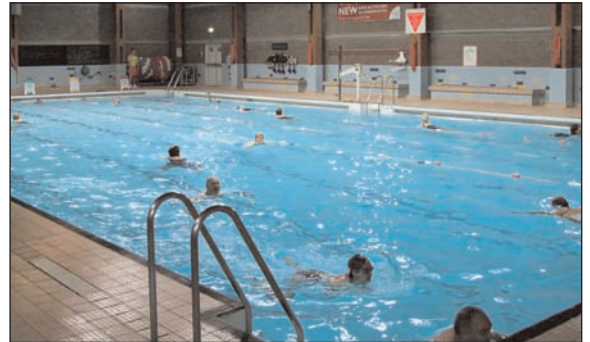
At a stroke: Free-style may take on a new meaning for over 60s at Fareham swimming pool.

It's the question that's already been answered in respect of the concessionary fares debacle, for the Government pays only 43% of the cost in Fareham.