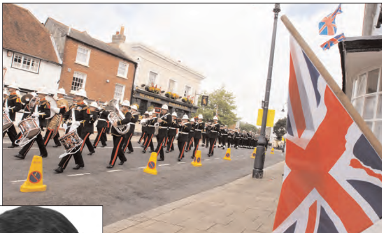
Simply the best: The Royal Marines Band and Fareham's Tories have plenty to celebrate.