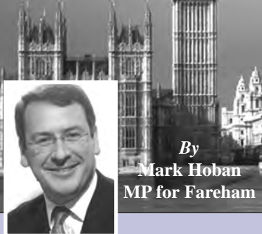
By Mark Hoban MP for Fareham

ONE OF the biggest issues in my post bag is tax credits. Figures released in May showed in the year to April 2006 that 900,000 families received less than they were due and 1.9 million received more than they were owed – one in three claims made end up with someone getting the wrong amount.