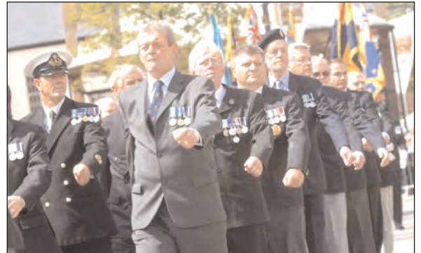
Marching in memory: Heads held high, medals glinting, Falklands veterans salute their leader in war.