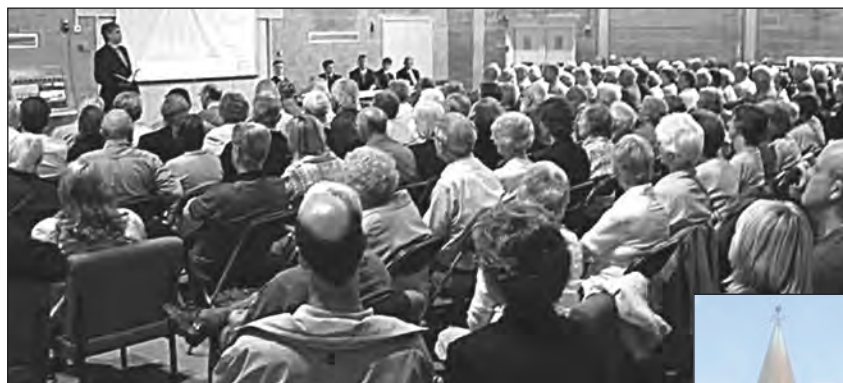
Packed: Residents turn out in force at the public meeting and (inset) Locks Heath Shopping Centre tower which is under threat.

WIDESPREAD concern over plans by the owners of Locks Heath Shopping Centre to demolish the landmark clock tower brought 400 residents flocking to a public meeting in the Community Centre.