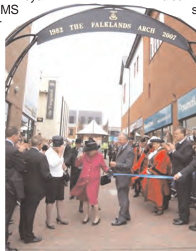
Lest we forget: Baroness Thatcher cuts the ribbon at the memorial

The Council commissioned the £25,000 arch to commemorate all who lost their lives in the war.