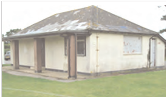
Ramshackle: It will soon be all change at the Locks Heath changing rooms.

Work will last about six weeks, but access will be maintained to the scouts' and social club premises and disruption kept to a minimum.