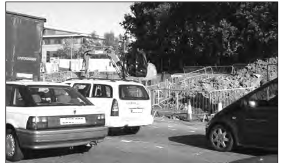
Under way: Work progresses at Segensworth

The County Council is working closely with the contractor to try to keep this to a minimum.