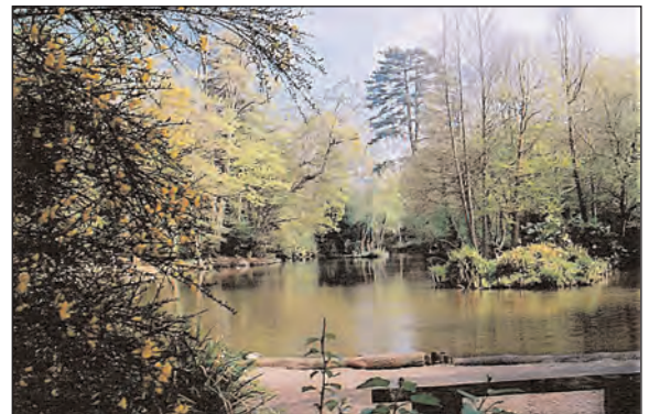
Beauty: With areas like Holly Hill Woodland Park in which to roam, it's no wonder the people are happy.