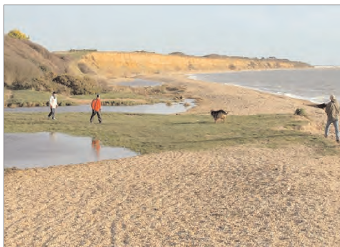
Cliff hanger: Gravel and sand would be extracted right to the Solent Shore cliffs, which already face coastal erosion.

"And at the end of all this disruption we