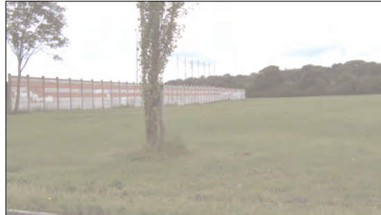
Staying green: This recreation space adjoining Fareham Town's ground would have been lost.