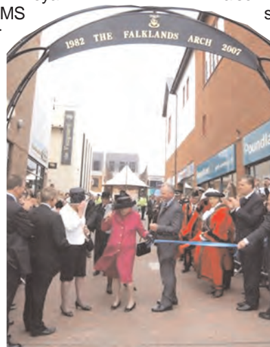
Lest we forget: Baroness Thatcher cuts the ribbon at the memorial

The Council commissioned the £25,000 arch to commemorate all who lost their lives in the war.