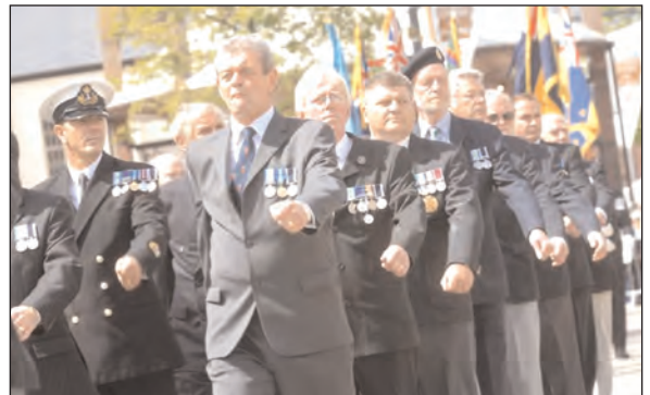
Marching in memory: Heads held high, medals glinting, Falklands veterans salute their leader in war.