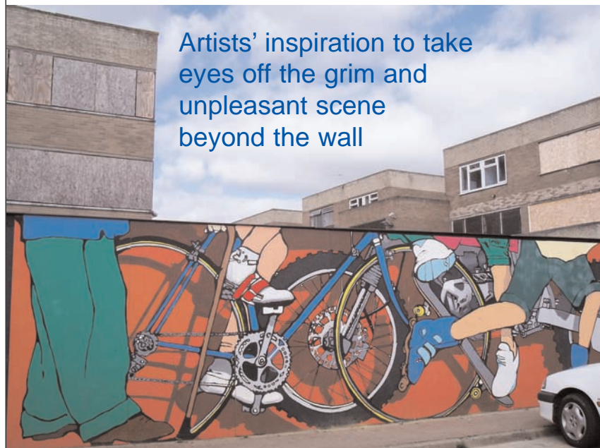
Artists' inspiration to take eyes off the grim and unpleasant scene beyond the wall