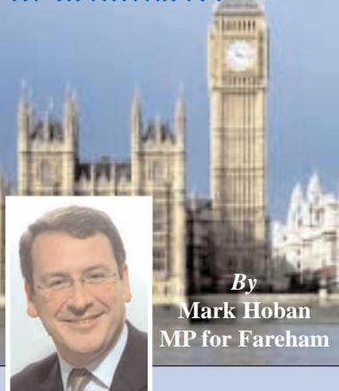
By Mark Hoban MP for Fareham

You have to make difficult decisions in your life, which require a sacrifice today to achieve a better tomorrow. Do you go to college to get more qualifications or straight into work; or sacrifice nights out to repay debt or save for a deposit?