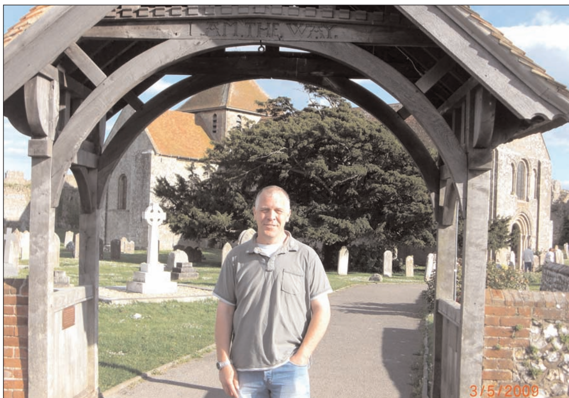
Gateway to success 'I am the way' are the words above the lychgate. A portent for Portchester voters?