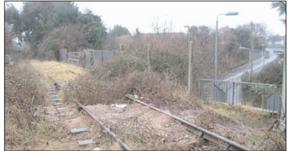
End of the line: The old overgrown track will be removed to clear the way for the new bus route to by-pass the congested A32 initially as far as Tichborne Way, Rowner and possibly later to Military Road.