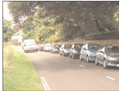
Dangerous: Cars parked in Wallington Shore Road force vehicles into the path of on-coming traffic, but other parts of the village are just as bad.