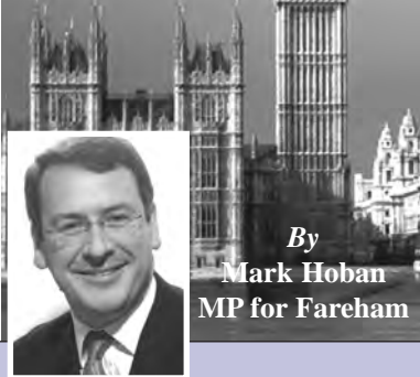
By Mark Hoban MP for Fareham

ONE OF the biggest issues in my post bag is tax credits. Figures released in May showed in the year to April 2006 that 900,000 families received less than they were due and 1.9 million received more than they were owed – one in three claims made end up with someone getting the wrong amount.