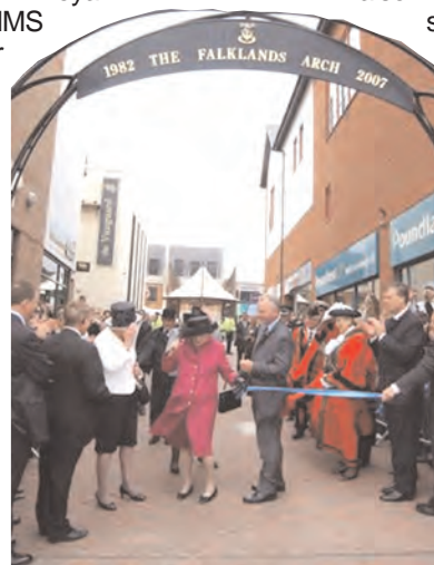
Lest we forget: Baroness Thatcher cuts the ribbon at the memorial

The Council commissioned the £25,000 arch to commemorate all who lost their lives in the war.