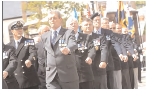
Marching in memory: Heads held high, medals glinting, Falklands veterans salute their leader in war.