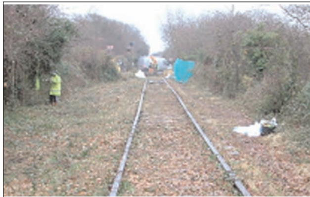
Flashback: Preliminary work to clear the overgrown rail track started at the beginning of the year.

Hampshire County Council won a legal battle after an anonymous 57-year-old woman challenged the scheme and called for a judicial review, saying she feared for wildlife.