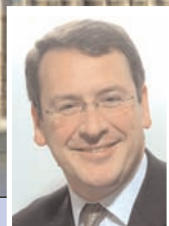
By Mark Hoban MP for Fareham

You have to make difficult decisions in your life, which require a sacrifice today to achieve a better tomorrow. Do you go to college to get more qualifications or straight into work; or sacrifice nights out to repay debt or save for a deposit?