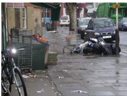
Litter strewn Manor Road W13

Enough is enough—it is time for our streets to be clean. A Conservative controlled Council will introduce a number of new elements to the rubbish collection and street cleaning service.