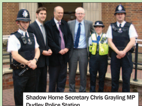
Shadow Home Secretary Chris Grayling MP Dudley Police Station

Labour's top-down approach to fighting crime has failed. They have ignored the professional judgment of police officers and denied them the freedom to do their jobs – violent crime has increased as officers are forced to spend more time on paperwork than on patrol. The bond between the police and the public must be rebuilt, and the first step will be cutting the paperwork which ties officers to their desks.