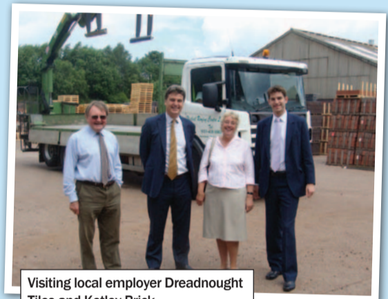
Visiting local employer Dreadnought Tiles and Ketley Brick

Alarming new official figures have revealed that Dudley South is one of the country's unemployment 'black spots'. Labour is now the party of unemployment. The Conservatives have launched a free-to-search, free-to-post online tool updated daily – www.GetDudleyWorking.com – to help local people find employment opportunities. Internet access is available at Dudley Council libraries – log-on today.